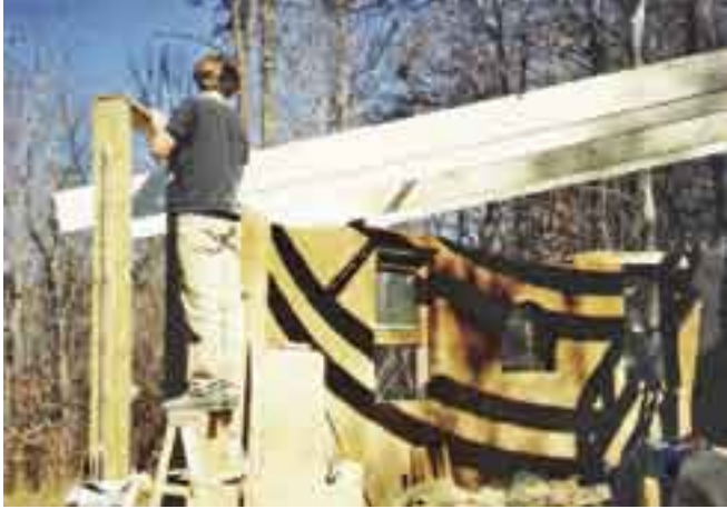
The author places the first rafters in the cob walls, after “keying” them to lock them into place.

Hybrid straw bale and cob. The cob provides the structure and thermal mass, while the straw provides the insulation.