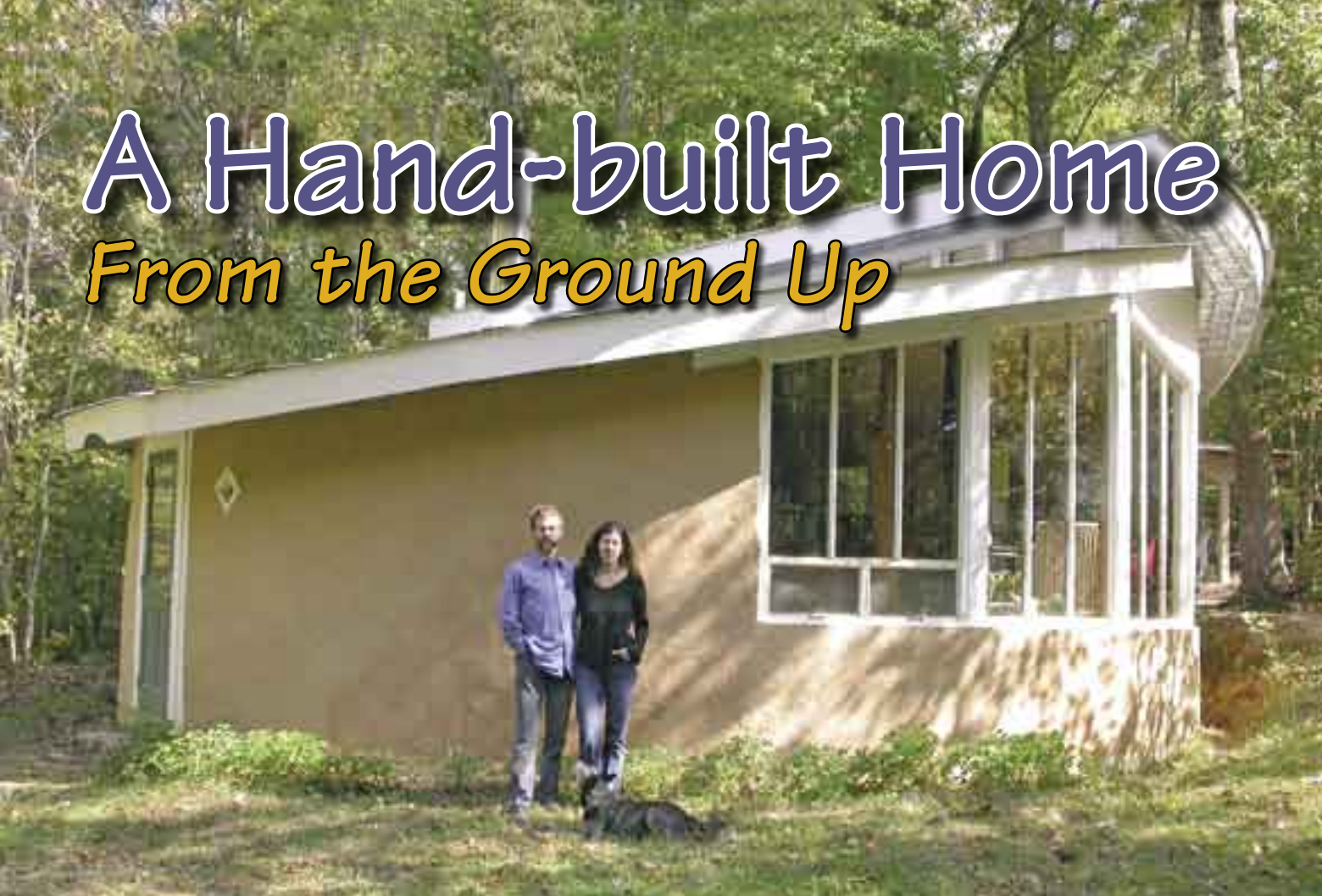
The author and his wife in front of their hand-built cob house in North Carolina.