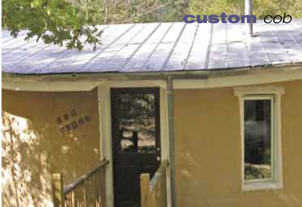
This gently sloped roof puts less weight on the cob walls while simultaneously providing enough of an angle to shed snow.

Additional support in the center of the house was necessary to transfer a portion of the roof's load directly to the ground rather than to the walls.